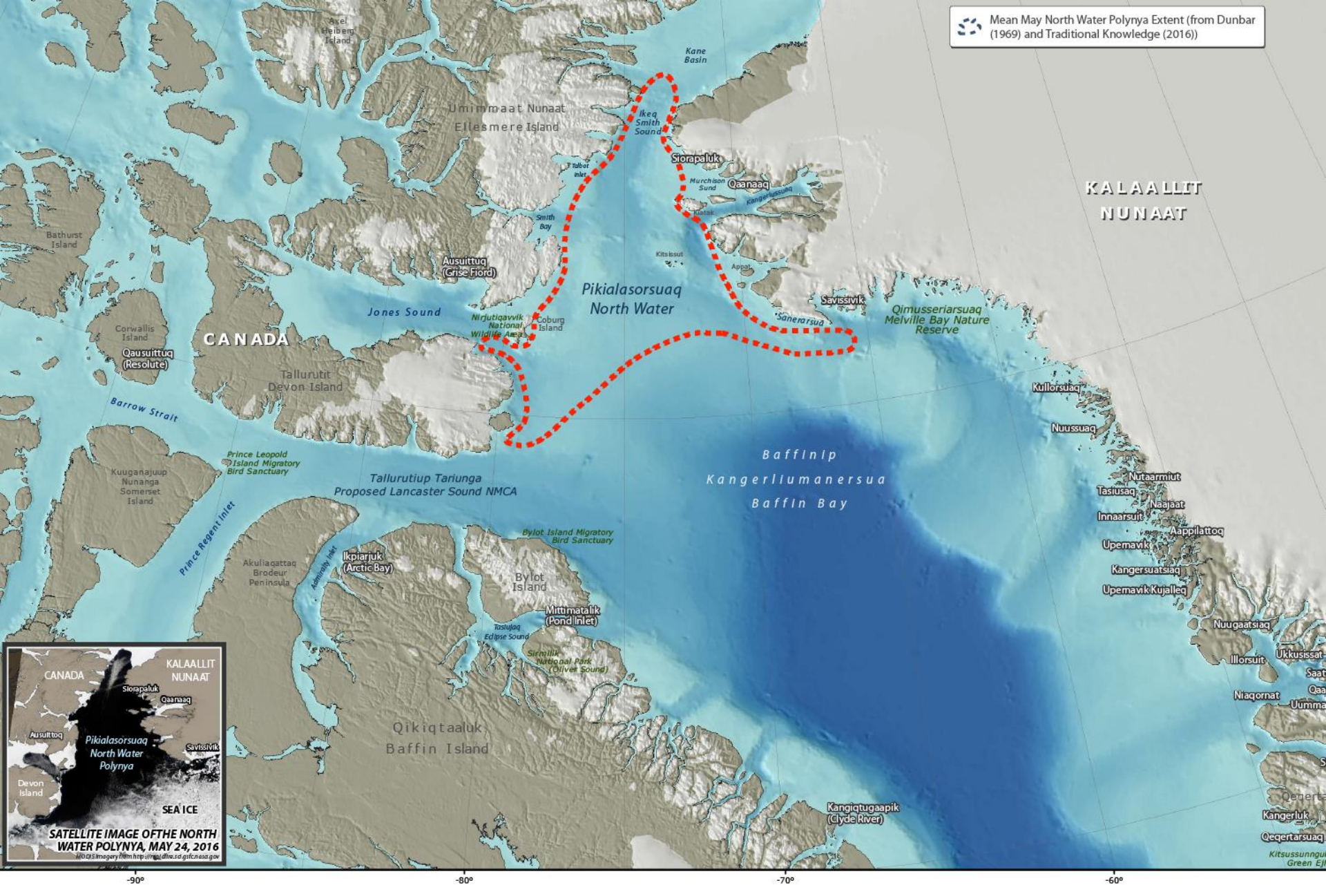
Map of Pikialasorsuaq between Nunavut, Canada and Greenland