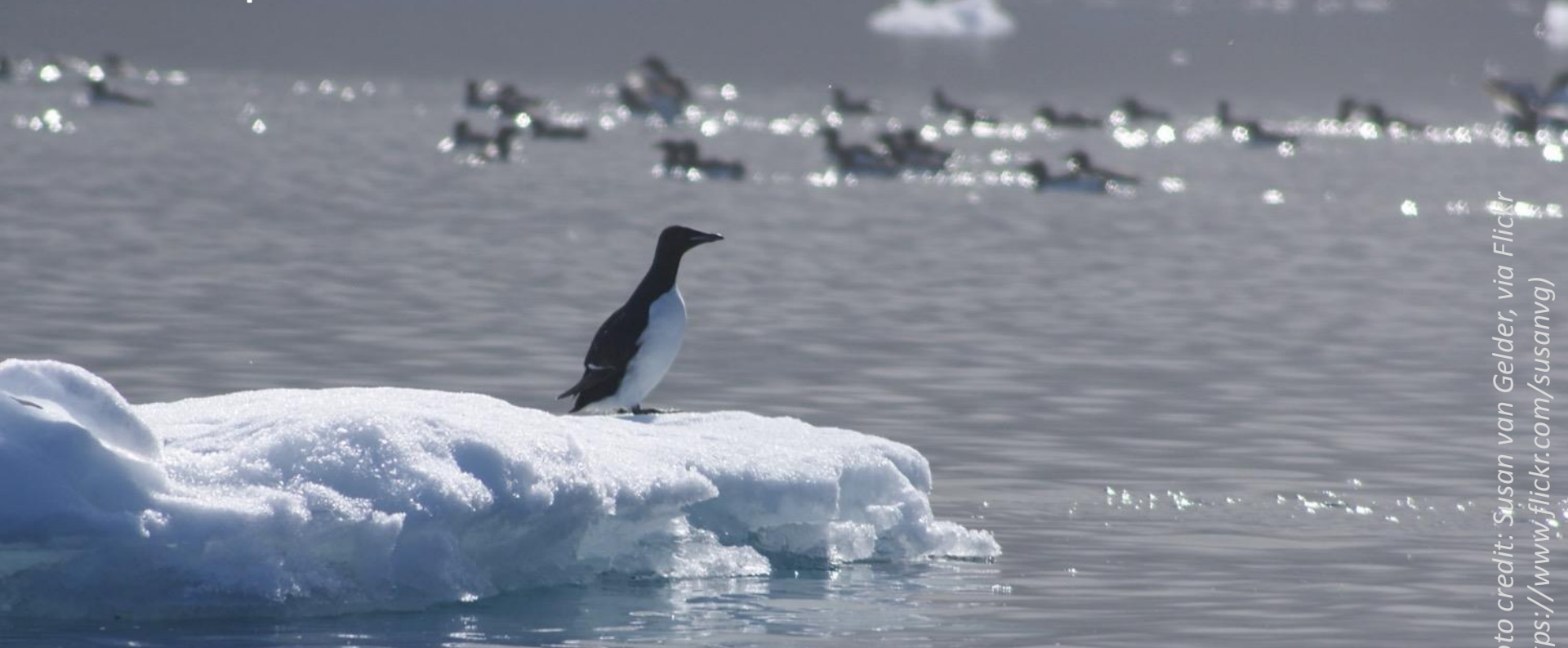
Thick-billed murre near Bylot Island, Nunavut