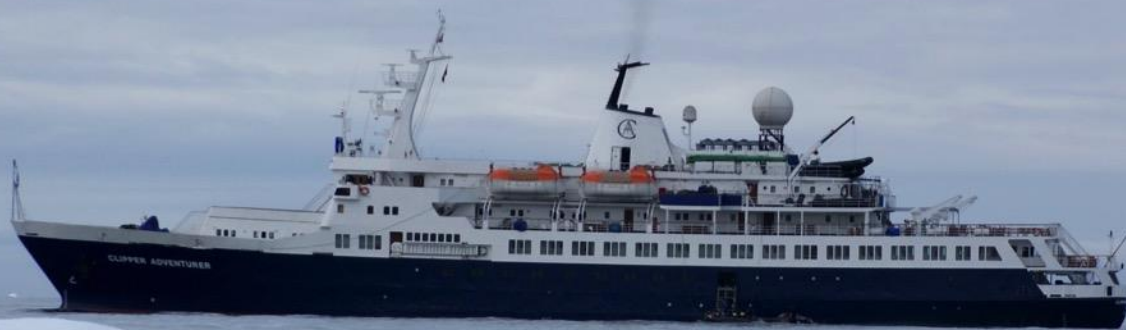
Clipper Adventurer tourist ship

–Marty Kulluguktuq, Ajuittuq (Grise Fiord)