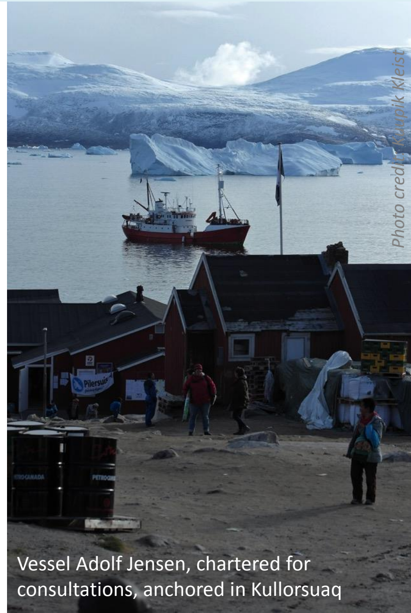
Vessel Adolf Jensen, chartered for consultations, anchored in Kullorsuaq