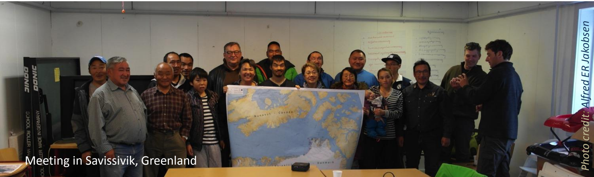
Meeting in Savissivik, Greenland