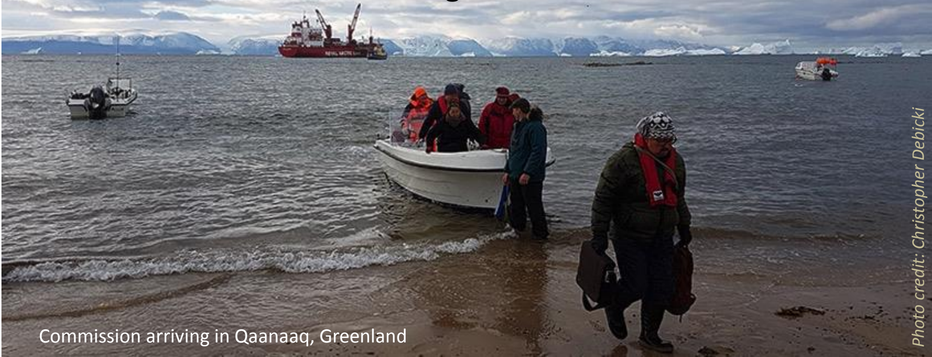
Commission arriving in Qaanaaq, Greenland