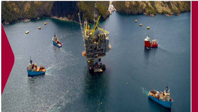
ADVANCE 2030 A Plan for Growth in the Newfoundland and Labrador Oil and Gas Industry