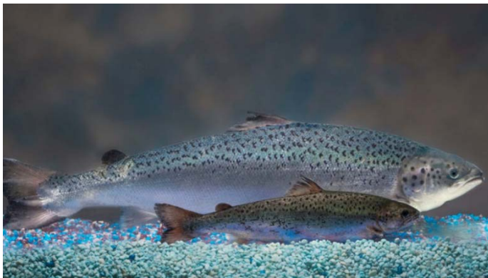
Figure 1. AquAdvantage® Atlantic Salmon (EO-1 \alpha Salmon) containing the opAFP-GHc2 transgenic construct (back) and non-transgenic Atlantic Salmon of equal age (front).