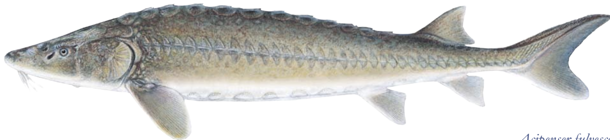
Acipenser fulvescens © J.R. Tomelleri

Eight designatable units have been identified for Lake Sturgeon based on genetic and biogeographical distinctions. Within the Saskatchewan River designatable unit (DU2), this species has been identified as Endangered by the Committee on the Status of Endangered Wildlife in Canada (COSEWIC).