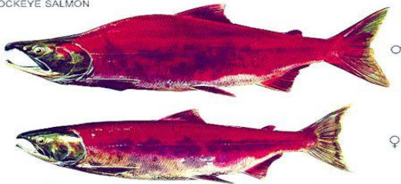
Sockeye Salmon adult spawning phase.