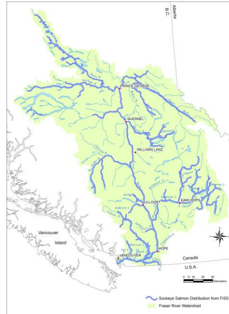
Figure 1: Sockeye Salmon spawning locations in southwestern BC.